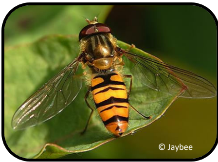
Marmalade hoverfly ( Episyrphus balteatus )