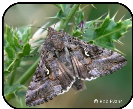
Silver Y moth ( Autographa gamma )