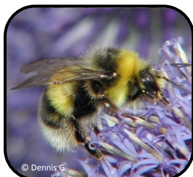
White-tailed bumblebee ( Bombus lucorum )

There are 24 species of bumblebee in the UK. Our common bumblebees usually have tails that are white, red or brown and some have yellow bands. They're important pollinators of crops such as raspberries, peas and tomatoes.