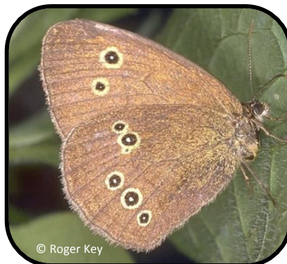
Ringlet butterfly ( Aphantopus hyperantus )

We have 59 species of butterfly that breed in the UK. They have two pairs of wings. Unlike most moths, they have clubs on the ends of their long antennae and at rest their wings close vertically above the body.