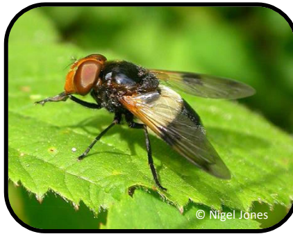
Hoverfly ( Volucella pellucens )

There are 281 species of hoverfly in the UK. They have large eyes and only one pair of wings. Some mimic bees and wasps but cannot sting. Adult hoverflies help to pollinate our crops and wildflowers, whilst hoverfly larvae eat aphids (like greenfly) and other garden pests.