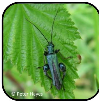
Thick legged flower beetle ( Oedemera nobilis )

There are around 100 pollinating beetle species in Britain.