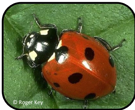
7 spot ladybird ( Coccinella-7-punctata )