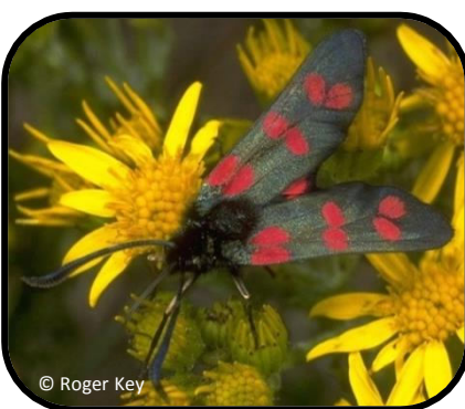
6-spot burnet moth ( Zygaena filipendulae )

Most moths fly at night but some fly during the day. Unlike butterflies, they have pointy, often feathery antennae and generally rest with their wings folded over the body.