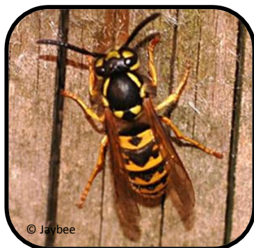
Common social wasp ( Vespula vulgaris )