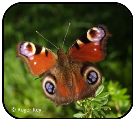
Peacock butterfly ( Inachis io )