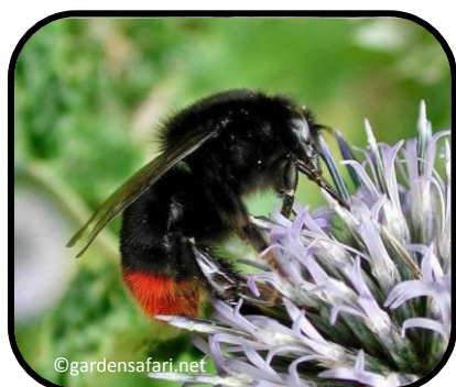
Red-tailed bumblebee ( Bombus lapidarius )