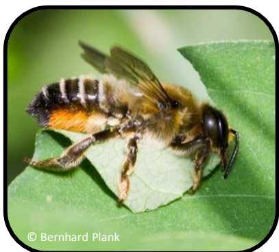
Leafcutter bee ( Megachile centuncularis )