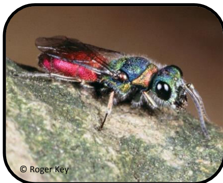
Ruby-tailed solitary wasp ( Chrysis ruddii )

Most social wasps are bright yellow and black with yellow markings on their face. Solitary wasps come in a variety of colours, shapes and sizes.